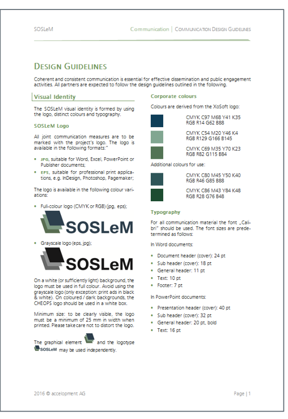
Figure 1: SOSLeM Design Guidelines