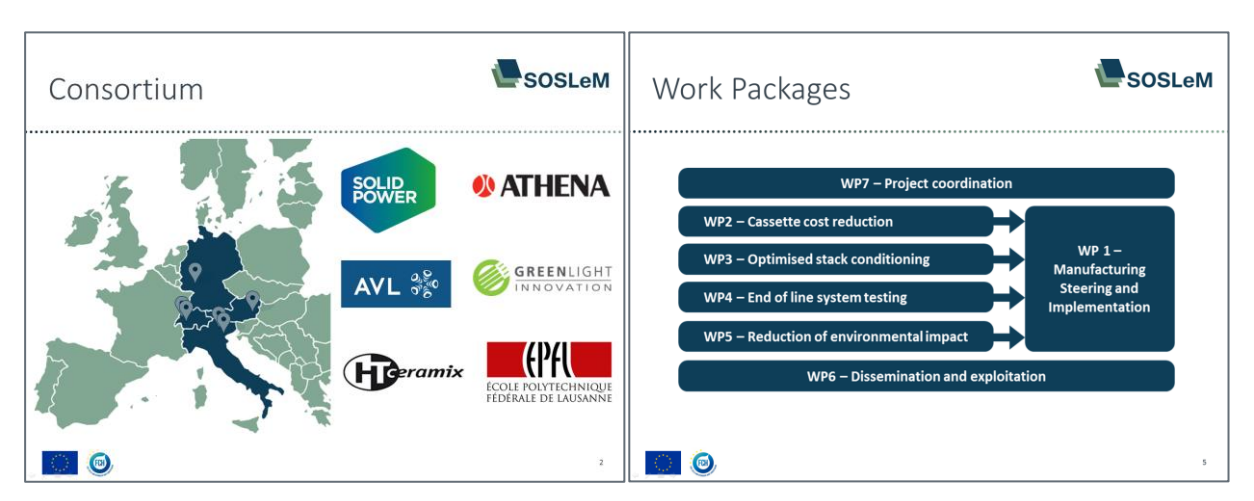
Figure 6: Outtake Slides SOSLeM Project Presentation

The SOSLeM Project Presentation is a more detailed overview of the project, its aims and goals. The presentation includes the following information: