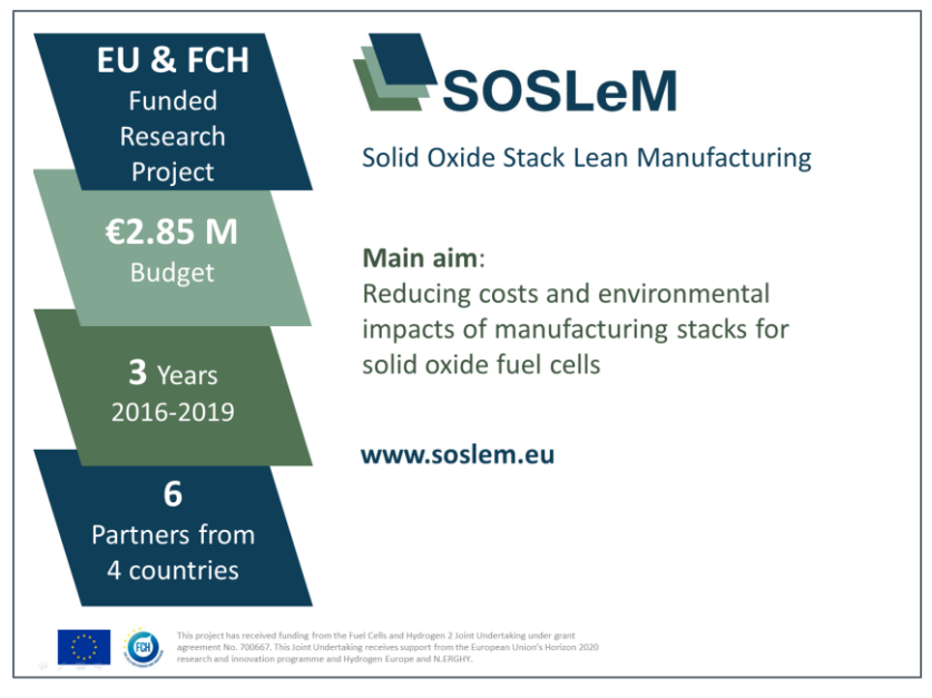
Figure 5: SOSLeM Project Overview Presentation

The SOSLeM Project Overview Presentation is a one slide document (Figure 5) which gives an overview of SOSLeM at one glance. Its purpose is to serve as an introductory slide to complement a partner's presentation.